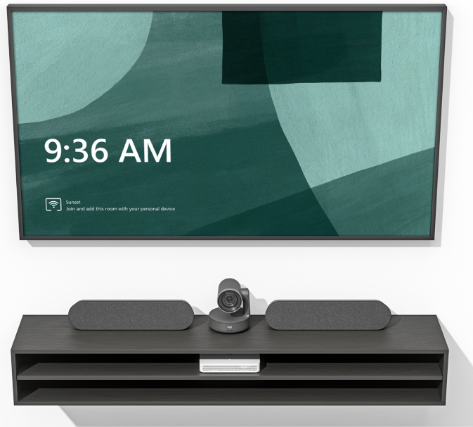
Logitech RoomMate shown with Rally Plus system